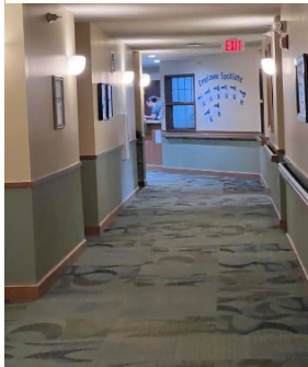
The view from the open door of the walkway to the assisted living.