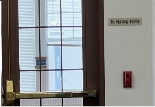
The door that connects the nursing home to Trinity Terrace.