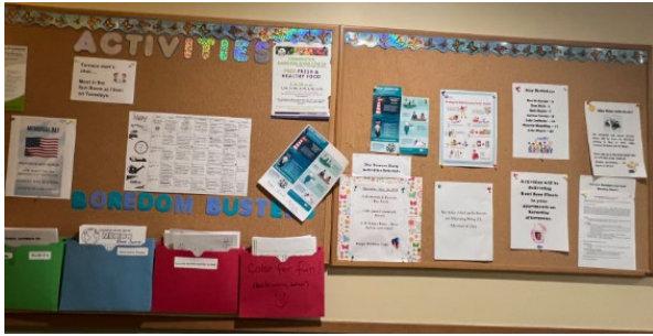
Bulletin board where activities and other events are listed

around here". People interviewed said they were happy with the amount of community access they had.