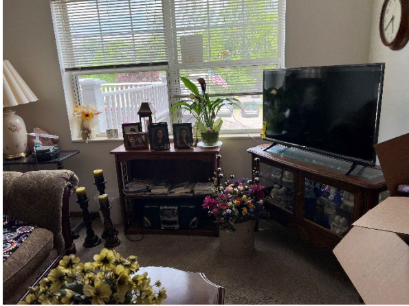
A resident's apartment decorated with flowers because she loves them.