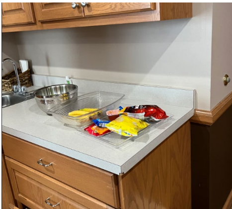
Snacks set out in the common area.