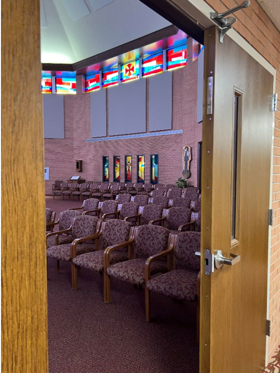
Chapel inside the setting