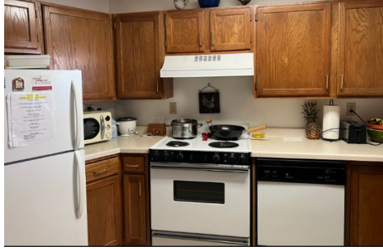
Full kitchen with refrigerator and stove.