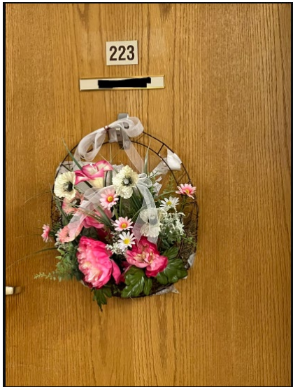
Flower wreath on a resident's apartment door