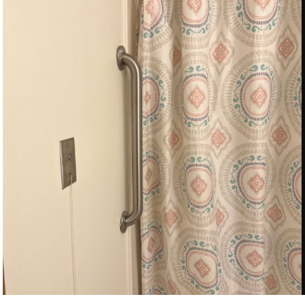
Grab bar in a resident's bathroom