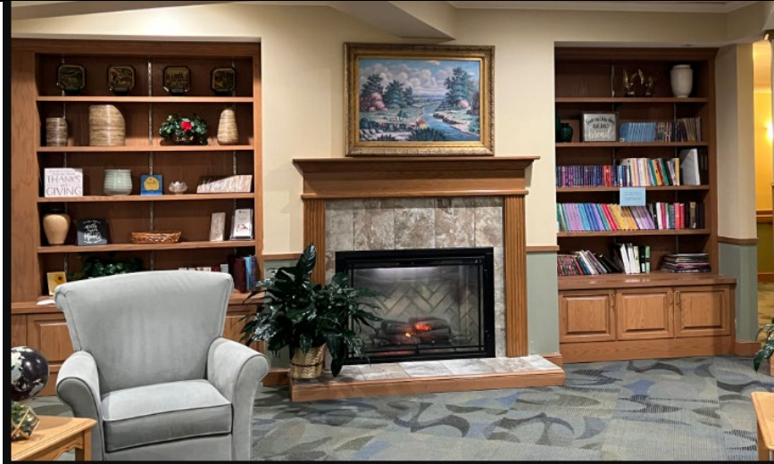
Lounge area with seating and a fireplace where people can sit with visitors if they choose.