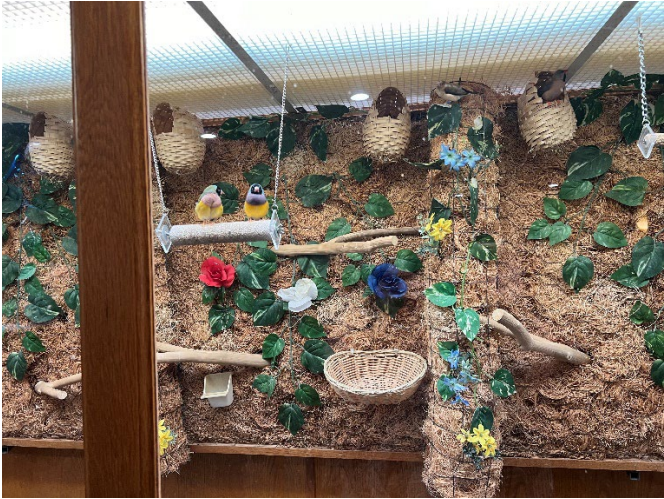
Aviary and the birds in the lobby of Trinity Terrace