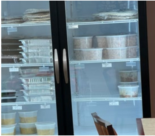
Cooler of food for people to purchase