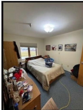
Bedroom decorated with the person's personal belongings.