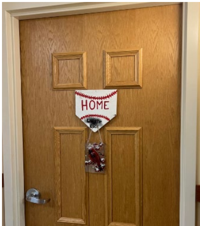
A door with baseball decoration hanging on it.

The resident handbook states people can decorate their units the way they would like to. During the on-site visit, it was observed that people's units were decorated with their own personal items and preferences. Individual decorations were also observed outside people's apartment doors.