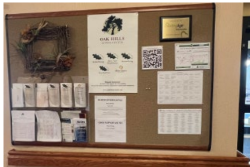
Photo of bulletin board with calendars and other information

People go out independently with family, friends, or other residents of Oak View often, some as often as daily. When interviewing the residents, staff, and administrators, they stated that the people are always “coming and going” to different activities. Some examples they gave of activities they participate in are: