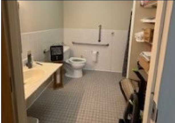
Bathroom inside an apartment with grab bars