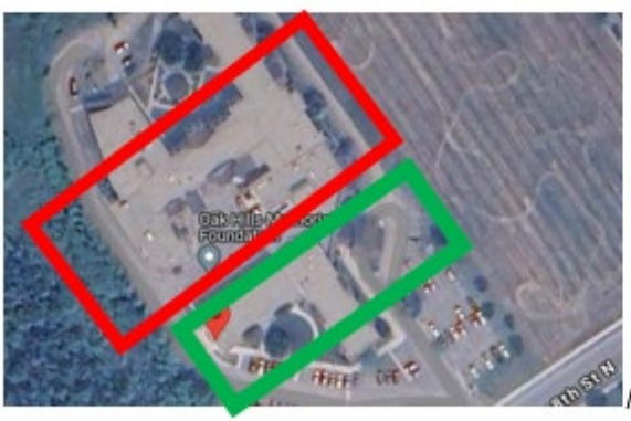
Aerial view with a red rectangle outlining the Oak Hills Living Center and the green rectangle outlines Oak View Apartments