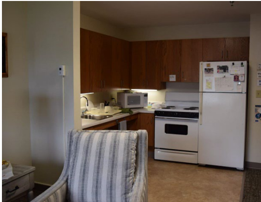
Full kitchen in apartment