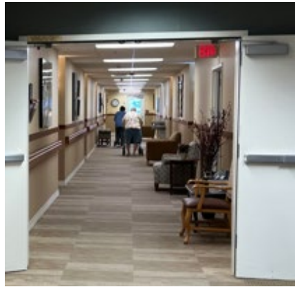
Wide hallway for easy navigation.

Any modification of the rights specified in HCBS rule under 441.301(c)(4)(vi)(A) through (D) must be supported by a specific assessed need and documented in the person-centered plan/ HCBS Rights Modification Support Plan Attachment.