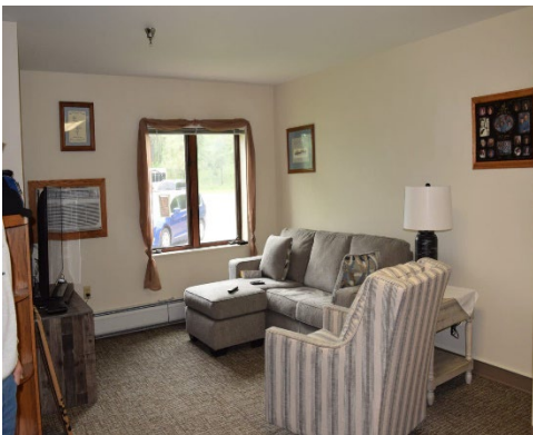
Living room in unit