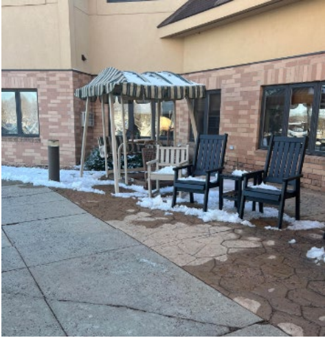
Patio outside apartment