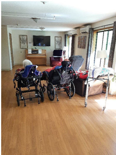
Three residents with accessibility aids such as reclining wheelchairs and a walker.