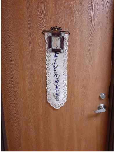
Resident apartment door with lock and decoration