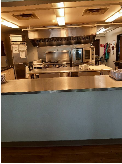
Shared commercial kitchen.