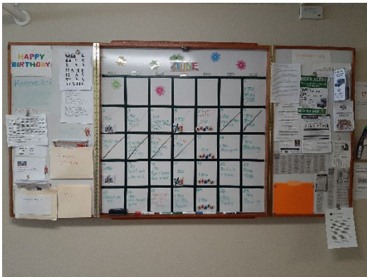
Community Life Board. Current activities and happenings in the setting and community.