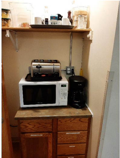
Toaster, microwave, and coffee pot available for residents who want a snack.