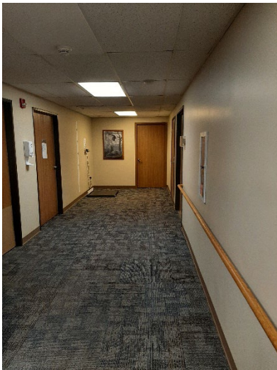
Hallway to skilled nursing facility.