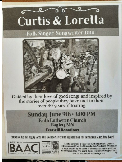
Community folk singer activity flier.