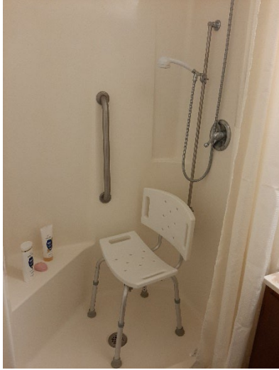
Shower chair and grab bars in a resident's shower.