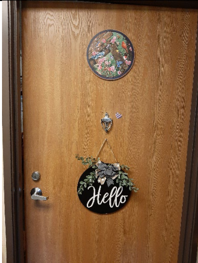
Resident apartment door with lock and decoration

The setting facilitates that a person, who shares a bedroom/unit, is with a roommate of their choice.