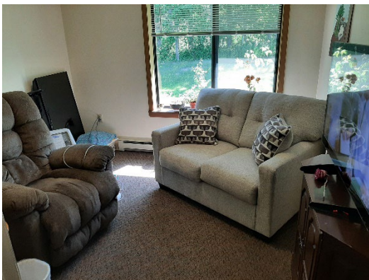
Resident's apartment with own furniture and decorations.

Cornerstone Residence Senior Care's policy/procedure is compliant. Administration reported upon interview that people are allowed/encouraged to bring their personal decorations and furniture from home to decorate their units. Residents interviewed confirmed that decorations and furniture were their personal belongings, and they were able to decorate the unit as desired. Apartments observed during the site visit were decorated according to the residents' tastes and preferences, including family pictures and memorabilia, crafts, and religious items. Residents also put-up personalized decorations on their apartment doors.