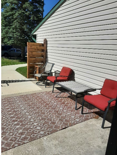
Outdoor seating area for residents and visitors