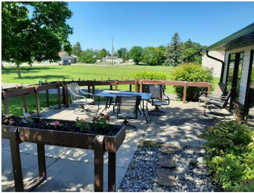
Outdoor patio chairs and table for outdoor seating. Elevated flower bed with flowers.