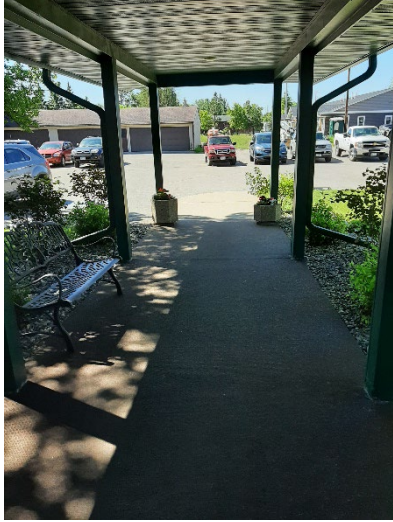
Covered entryway/exit to the setting. Sitting bench available for sitting. People are free to come and go.