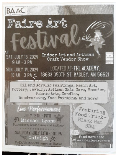
Community activity flier for Faire Art Festival.