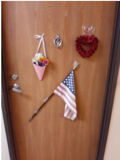
Resident apartment door with lock and decoration