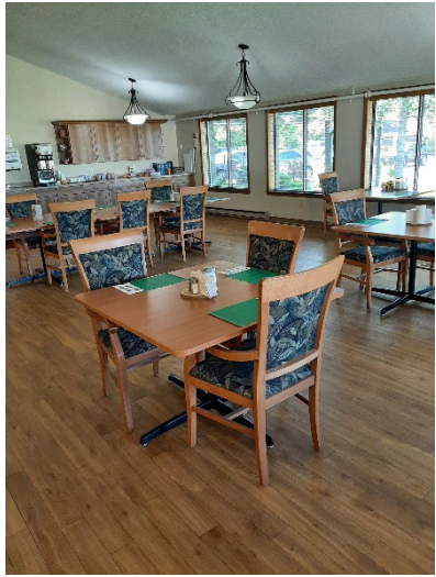
Shared dining area with coffee and snacks available.