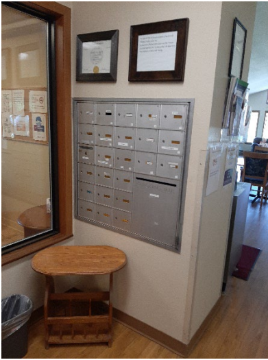
Resident locked mailboxes for privacy.

Observed staff knock on resident's unit door prior to entering.