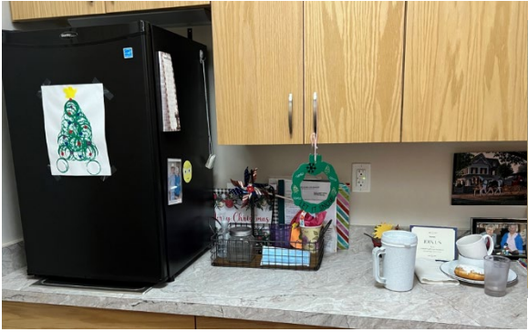
Mini refrigerator in the apartment