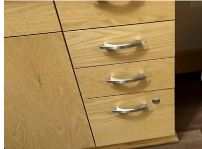
Drawers with locks on them