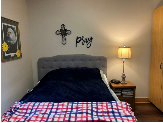
Resident bedroom with personal decorations.