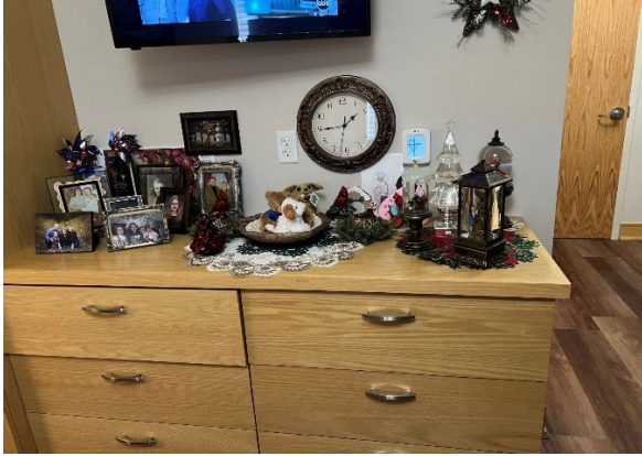
A resident's collection of decorative items