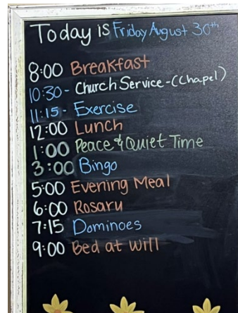
Schedule posted on chalk board

Setting’s policy/procedure was reviewed and are compliant with HCBS settings rule requirements. This right is reviewed with the resident upon move-in. The resident handbook states that residents are “able to choose which activities they attend while residing at Benedictine Asher Haus. Tenants also can choose what independent leisure and community events they are involved in. Tenants have the right to refuse to participate in any leisure activity that is offered.” Staff are trained on this right at hire and as part of staff annually training on the HCBS rule and Assisted Living Bill of Rights. Interviews with LALD and staff confirmed that people have choices about their lives. One resident stated during an interview “I make my own decisions”. Another resident said they feel like they plan their own days. She said, “For instance, if I want to sleep in and staff come to my apartment and ask me to do something, if I say no, they will come back later.” Staff use iPads and if a person has a change in their cares, schedules, or preferences, all the staff working with that person will get an alert on the iPad, which they must sign off on. This ensures that people’s choices are documented and read by staff, so nothing gets missed.