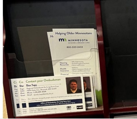
Business card and brochure for area Ombudsman

Setting's policy/procedure is compliant with HCBS settings rule requirements. Both the staff and the residents receive the Assisted Living Bill of Rights which outlines these rights. Staff receive annual training on the HCBS rights which includes this right. Per policy, no restraints are used, and coercion is prohibited.