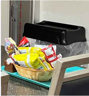
Bowl of snacks in the setting