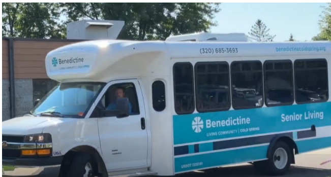
Blue and white Benedictine 13 passenger van

During interviews, staff and administrators indicated that the residents have a variety of transportation options to choose from. The setting uses their own bus and van to transport residents into the community. Tri-CAP (TRI County Action Program) offers low cost, on demand rides to community like a Dial-A-Ride service to members in Benton, Sherburne and Stearns counties. Tri-CAP also coordinates rides for people that are provided by volunteers. Residents or their authorized representative are given this information at the time of move-in and staff are available to assist them any time they need assistance with transportation. Because this is a memory care facility, staff stated in interviews that family members usually take the residents to appointments. Observed one of the setting vehicles in the front parking lot. Observed residents being dropped off and picked up in the front area by family members and friends.