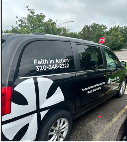
Black and white Faith in Action van us.