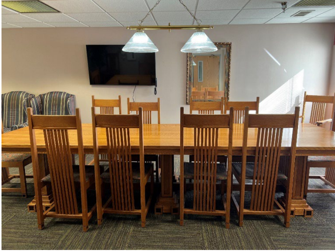
Private room that can be rented for special occasions