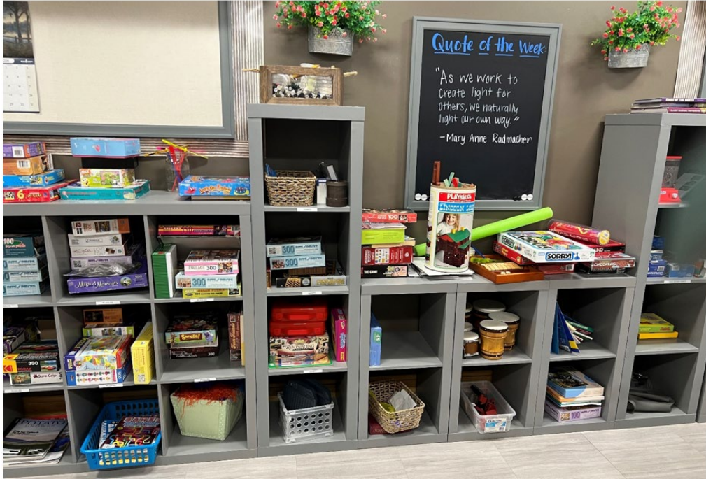
Room for people to do puzzles, play games or relax