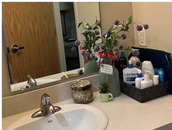
Decorations in a resident bathroom

During the resident interviews one resident said, "You can decorate any way you want." Another said, "I got to bring so much stuff from home, I was kind of surprised it all came together, but it did".