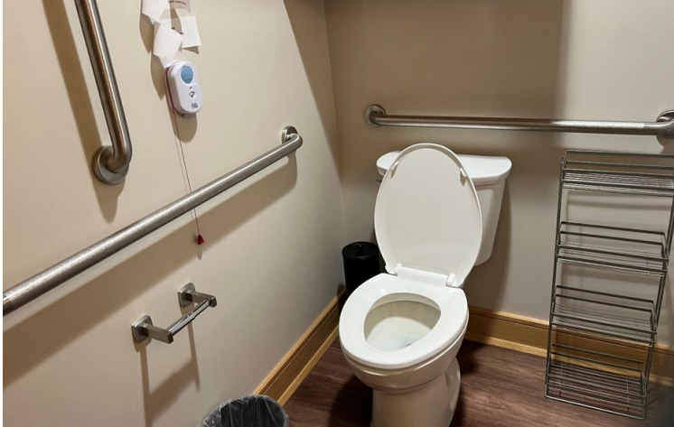
Bathroom with grab bars and emergency pull cord.