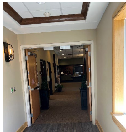
Open door connecting Asher Haus to Assumption Home