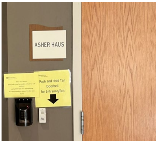
Door connecting Asher Haus to Assumption Home