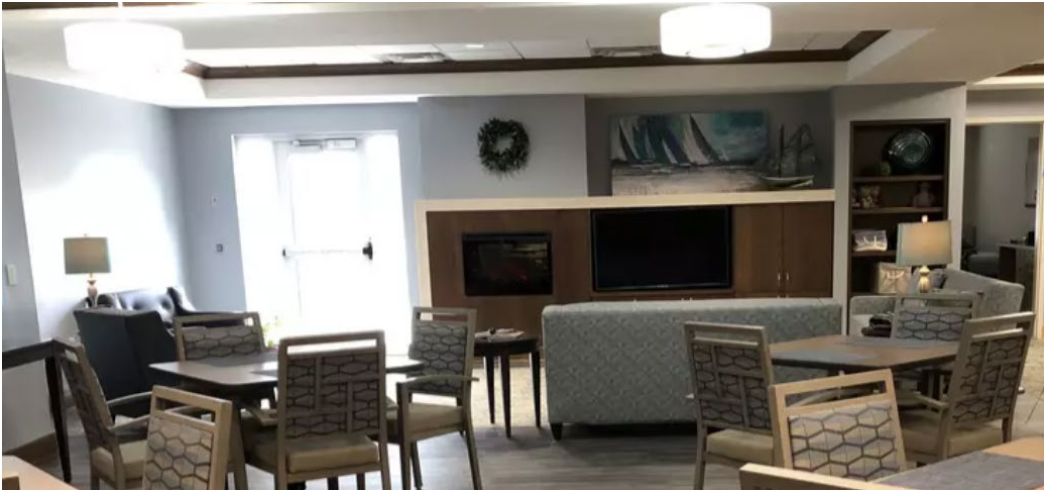
Lounge area next to the dining room