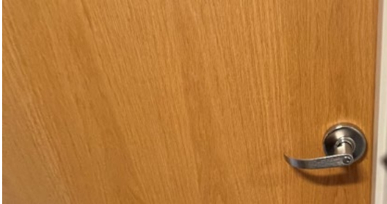
Lock on the apartment door

access to come visit, they can give them a code to the keypad. This setting has some residents who have dementia, for safety reasons, staff have to buzz people out of the setting if they don't have a code. People who are able to leave the setting safely have a code to open the door. One resident interviewed stated, "Sure, I can lock my door If I want." When asked if staff respect their privacy, one resident stated, "Oh yes, they do." Another resident said "They always knock at least 3 times and wait before they come in."