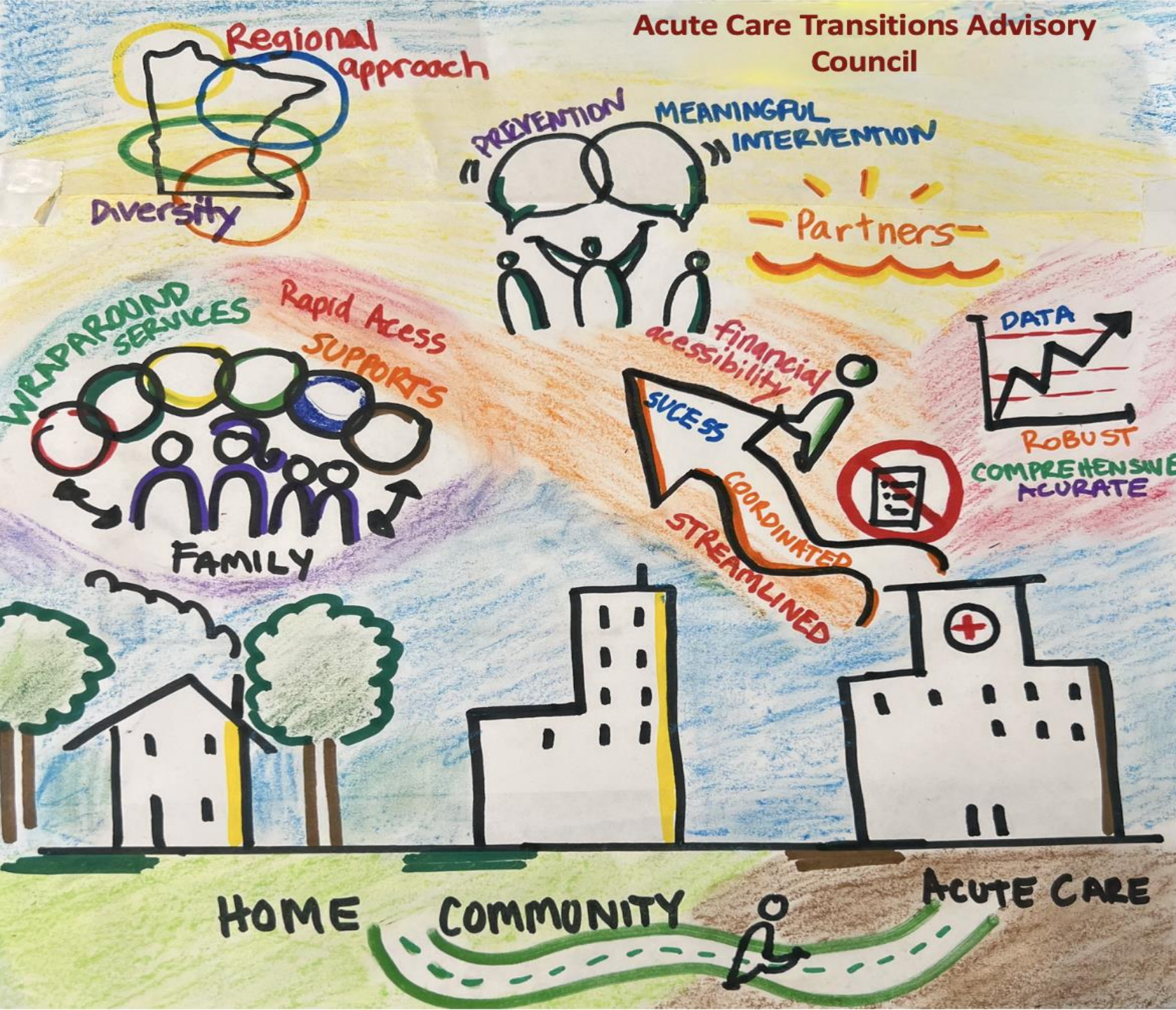
Futures Vision Derived from Council Members